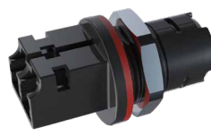
HEC Bulkhead Adapter, LC