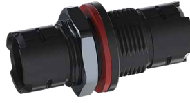
HEC Inline Adapter, LC