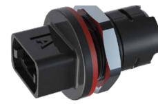
HEC Bulkhead Adapter, MTP®