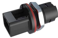
HEC Bulkhead Adapter, SC

US Conec offers both bulkhead and inline adapters for the HEC-DC connector line. Bulkhead adapters allow the HEC-DC to be mated with traditional SC, duplex LC, and MPO connectors. Inline adapters allow HEC-DCs to be mated in series.