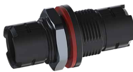
HEC Inline Adapter, SC