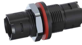
HEC Inline Adapter, MTP®